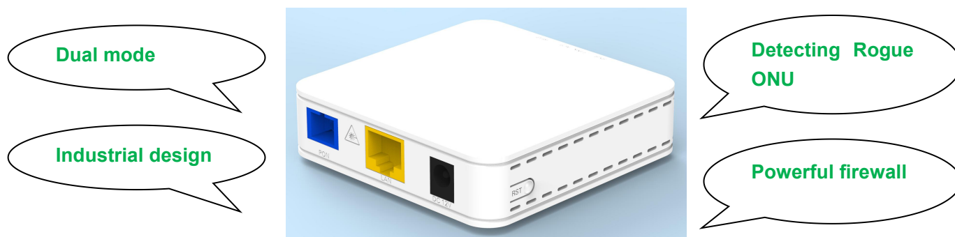
Figure 1 G/EPON 1GE ONU

G/EPON 1GE ONU meets telecom operators FTTO (office), FTTD (Desk), FTTH(Home) broadband speed, SOHO broadband access, video surveillance and other requirements and design a GPON/EPON Gigabit Ethernet products. The box is based on the mature Gigabit GPON/EPON technology, highly reliable and easy to maintain, with guaranteed QOS for different service. And it is fully compliant with technical regulations such as ITU-T G.984.x and IEEE802.3ah.